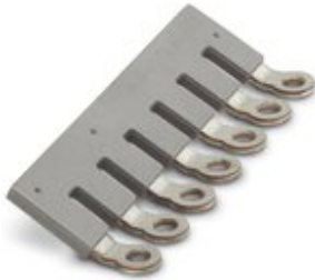
Insertion bridge, pitch: 11.1 mm, number of positions: 7, color: gray

Please be informed that the data shown in this PDF Document is generated from our Online Catalog. Please find the complete data in the user's documentation. Our General Terms of Use for Downloads are valid ( http://phoenixcontact.com/download )